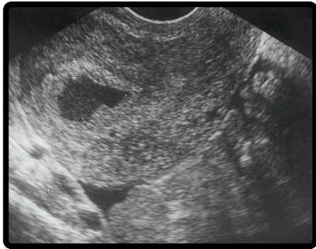
pseudogestational sac in ectopic pregnancy with no yolk sac and free fluid

Rule out Ectopic Early pregnancy and Abdominal pain or Vaginal bleeding or Syncope