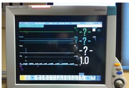
Fig 2 Capnography during CPR in a patient in cardiac arrest. The attenuated capnography trace is seen when pulmonary ventilation is occurring. A flat capnograph trace should be assumed to be because of oesophageal intubation (or rarely airway blockage) until this has been actively excluded.